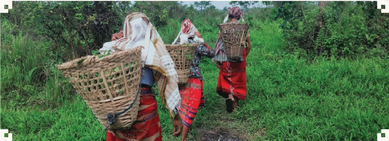
Recipients of Rewilding the Eastern Himalaya Grants 2022

All award recipients would be provided monetary benefit to upscale their restoration plans. Balipara Foundation would also provide consultancy and a platform to connect the awardees with like minded people. The award winners can use these resources to create a larger impact in the future.