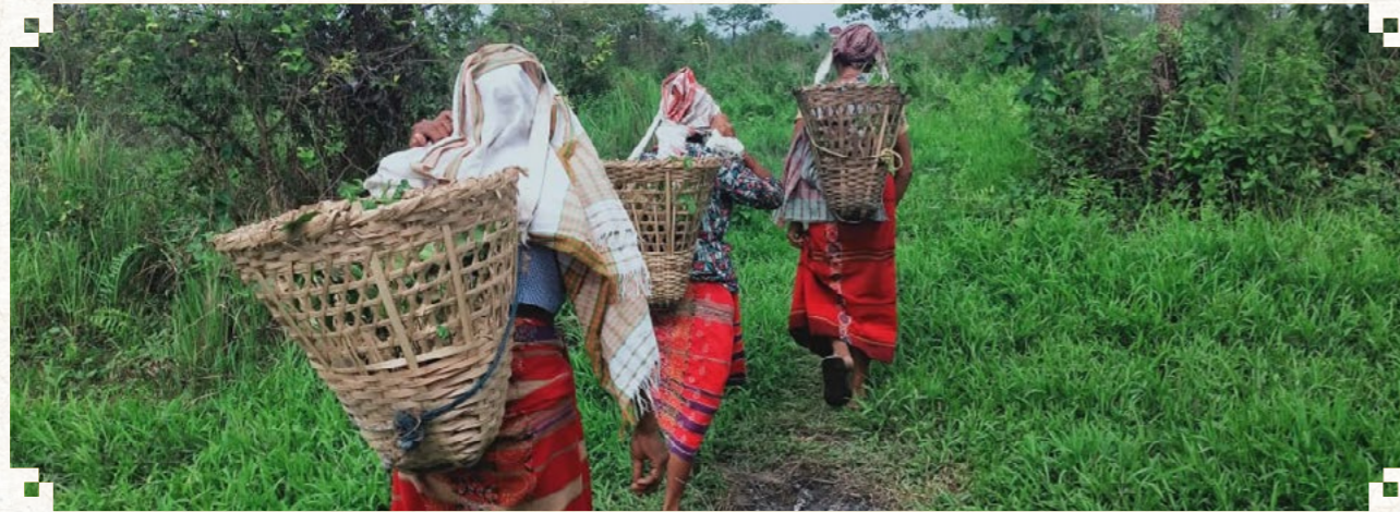
Recipients of Rewilding the Eastern Himalaya Grants 2022

All award recipients would be provided monetary benefit to upscale their restoration plans. Balipara Foundation would also provide consultancy and a platform to connect the awardees with like minded people. The award winners can use these resources to create a larger impact in the future.